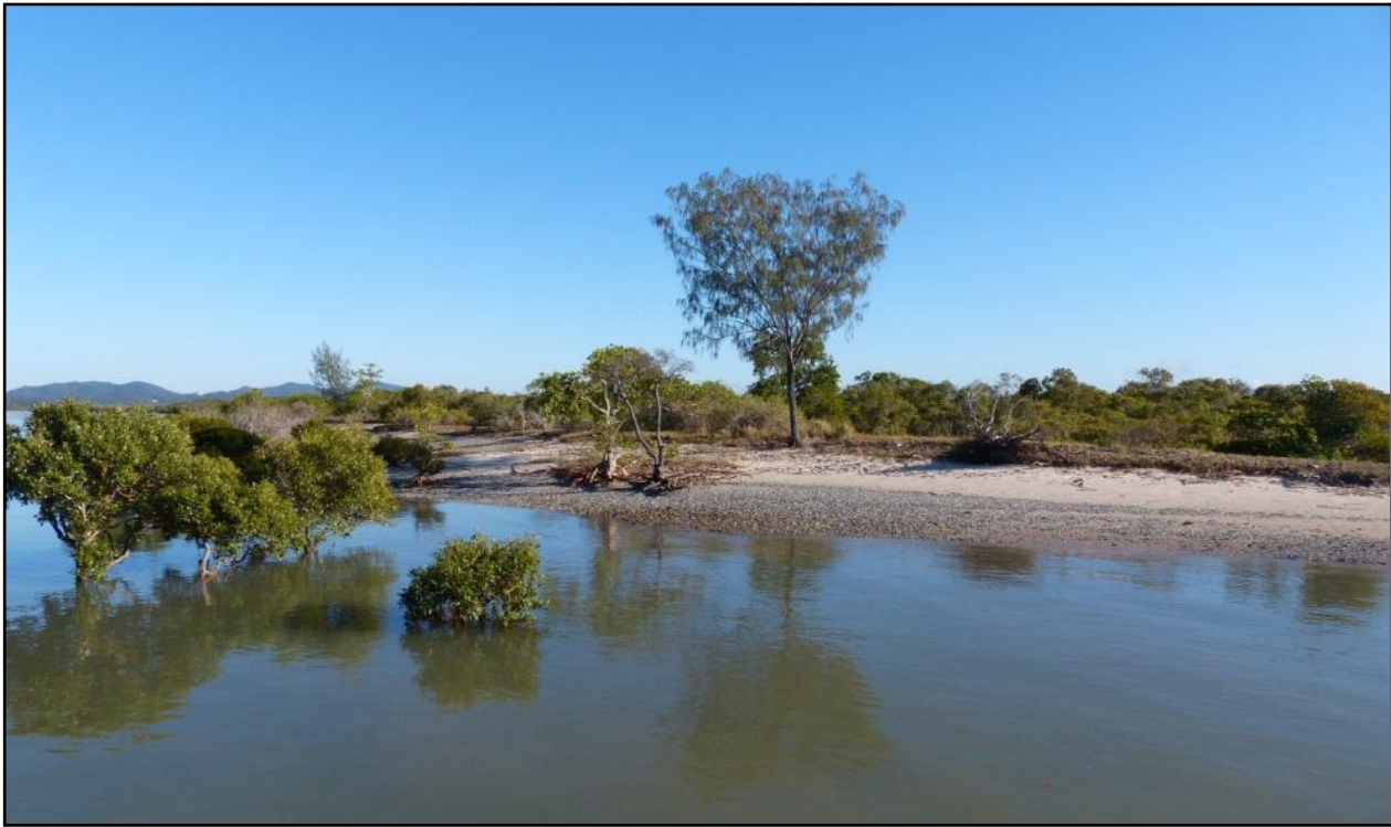
Figure 4.3: Pebble Beach in the lower reaches of the Cawarral Creek declared FHA.