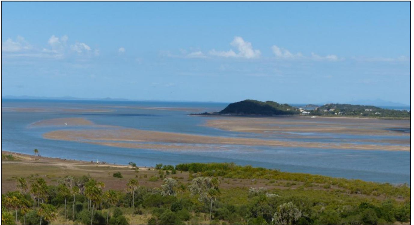
Figure 4.6: Intertidal sand flats toward the mouth of the Cawarral Creek declared FHA.

Extensive intertidal flats exist throughout the lower reaches of the declared FHA where the estuary drains into Keppel Bay. These habitats develop in sheltered places where the water velocity slows and are important sedimentation areas, with high productivity and nutrient value. Intertidal flats support a diversity of burrowing and surface fauna and interstitial algae providing a direct food source for fish species (Long & McKinnon 2002).