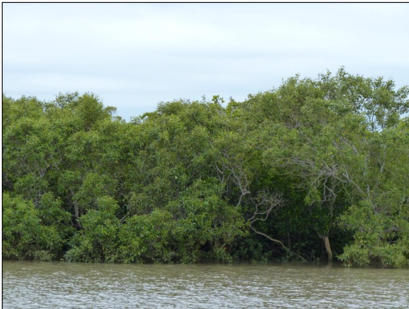
Figure 4.8: Closed Avicennia mangrove communities lining the Cawarral Creek branch of the declared FHA.

Within the Cawarral Creek declared FHA, extensive forests of mangroves line the estuarine system and small creeks. Communities are dominated by Closed Aegiceras , Closed Rhizophora and Closed Avicennia species.