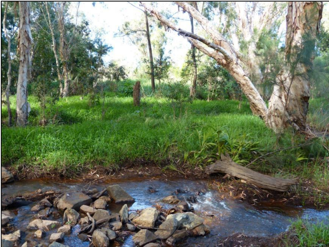
Figure 4.16: Para grass infestation within the Cawarral Creek declared FHA.