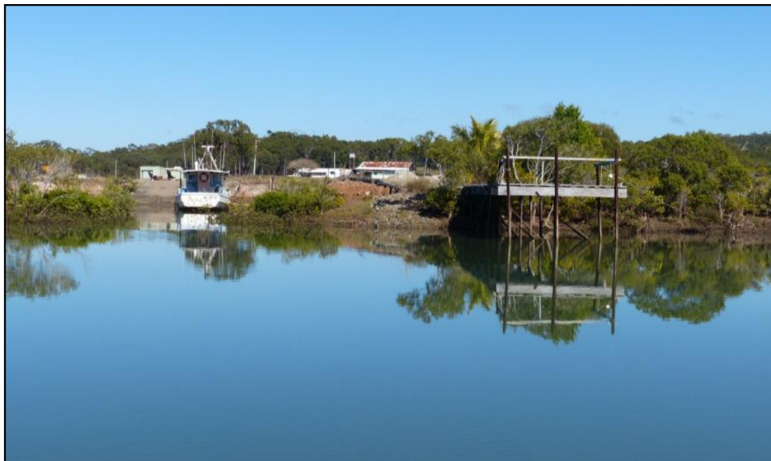
Figure 4:15: Example of unlawful artificial structure within the Cawarral Creek declared FHA.