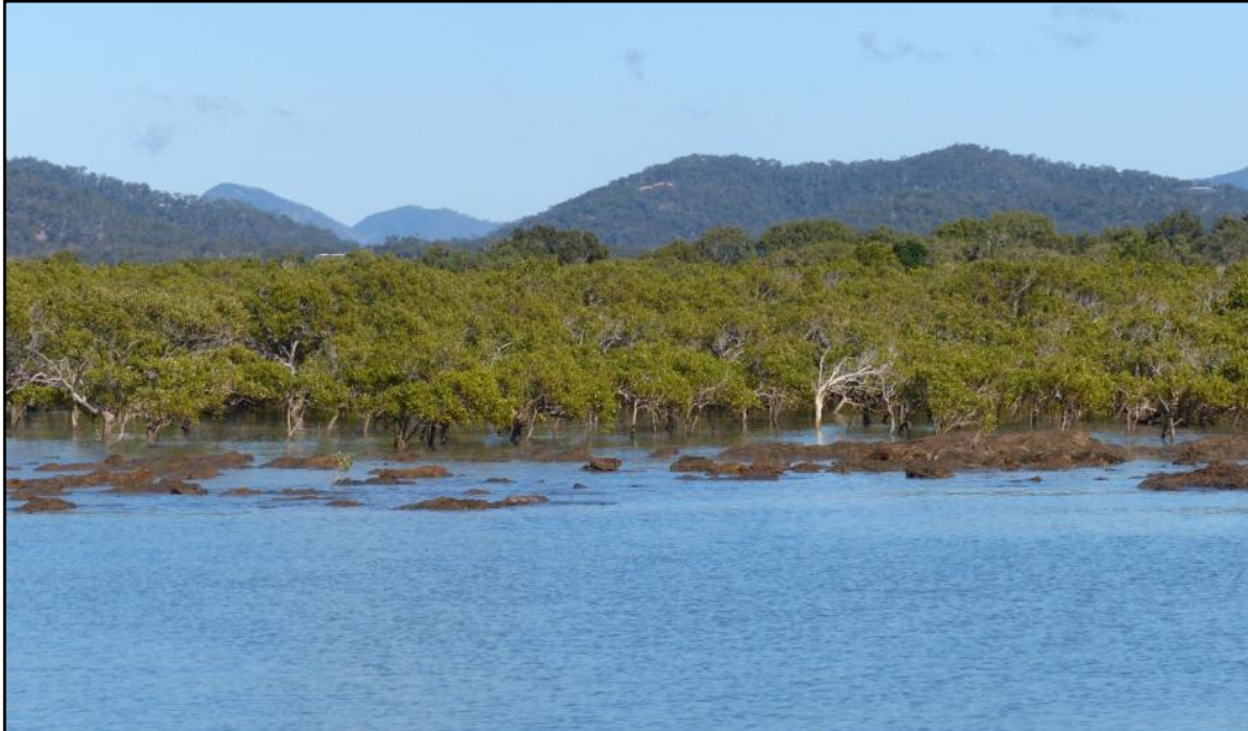
Figure 4.11: Intertidal rocky structures at the junction of Horton's Creek and the main channel.

Rocky structures provide a hard substrate for the attachment of rich algal flora and immobile invertebrate communities (barnacles, oysters and tube worms), contributing to the primary production within waterways (Zeller 1998). Cawarral Creek declared FHA contains intertidal rocky structures as well as rocky bars throughout its creek system which remain partially submerged at low tide. Horton's Creek contains a rocky outcrop that is well known as an aggregation point for salmon and bream (Capricorn Region Salvation Army 2013).