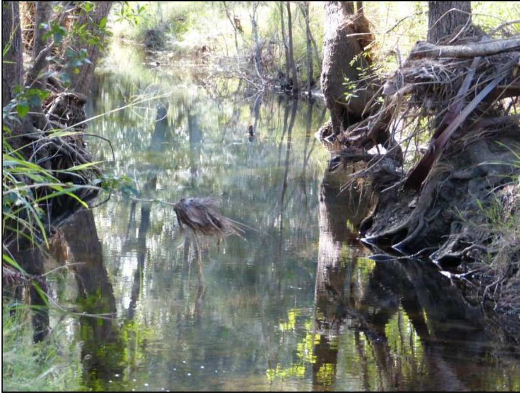
Figure 4.10: Freshwater lagoon inside the Cawarral Creek declared FHA boundary. (Upper reaches)

Realignment of boundaries in 2003, to match cadastral boundaries as per the digital cadastral database, enabled upstream fresh waters to be included within the declared FHA. While the extent and duration of connectivity with the estuarine system are difficult to determine, it is most likely that flow occurs only during rainfall events. These upstream waters provide valuable freshwater habitats for use by juveniles of a range of marine species such as barramundi, mangrove jack, mullet and tarpon (Baker & Sheppard 2006).