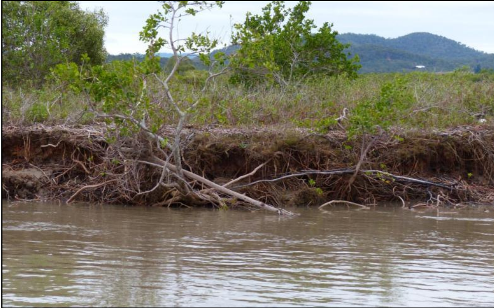
Figure 4.13: Undercut bank typical of the bank structure throughout the Cawarral Creek declared FHA.

Overhanging and undercut waterway banks provide shelter and protection for juvenile fish species and their prey species. These banks normally form as a result of natural erosion processes. However, this can be accelerated by the wash resulting from significant boat activity (Baker & Sheppard 2006). Within the Cawarral Creek declared FHA, natural undercut banks are found along many of the waterways.