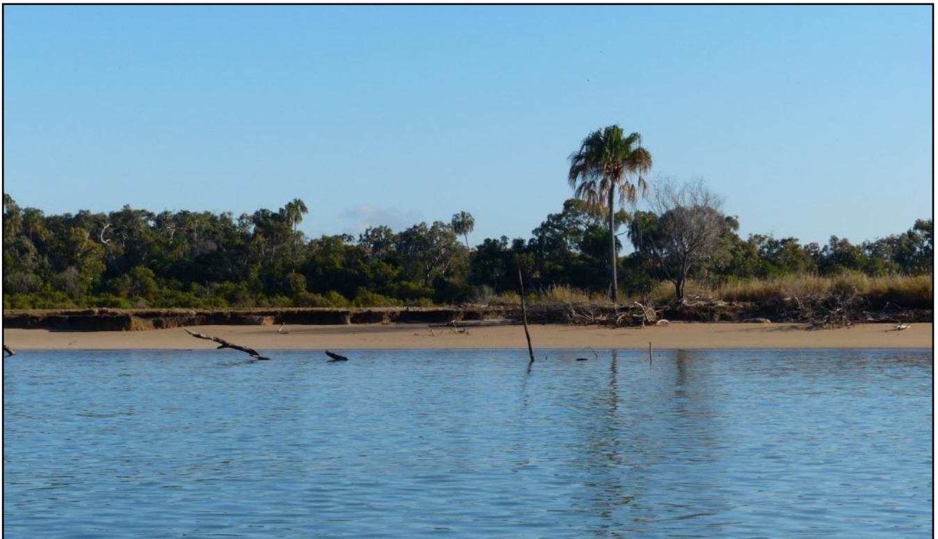
Figure 4.2: Sandy beach typical of those in the lower reaches of Cawarral Creek declared FHA.

The lower reaches of the declared FHA contain large areas of sand and pebble beaches. These habitats support communities of algae which provide food sources for zooplankton and filter feeding invertebrates (Zeller 1998). Insects and burrowing animals, such as small crustaceans, worms and molluscs are common to these habitats and attract indigenous, recreational and commercially targeted fish species such as whiting, bream, flathead and mullet.