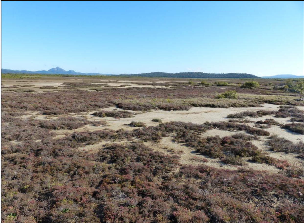
Figure 4.7: Saltmarsh typical of those throughout the Cawarral Creek declared FHA.

Despite the relatively low duration and inundation of intertidal saltmarshes and saltpans, these habitats have been found to have significant habitat values for many species of fish, including those of economic importance such as bream, whiting and mullet (Thomas & Connolly 2001, Mazumder et al. 2006). In a study of the use of subtropical saltmarsh habitats by fish species, (Thomas & Connolly 2001) found there was no significant difference between the species richness captured in vegetated and un-vegetated habitats, with a high number and diversity of estuarine resident and estuarine/marine fish species utilising the entirety of these habitats, some captured over 400 metres from sub-tidal water.