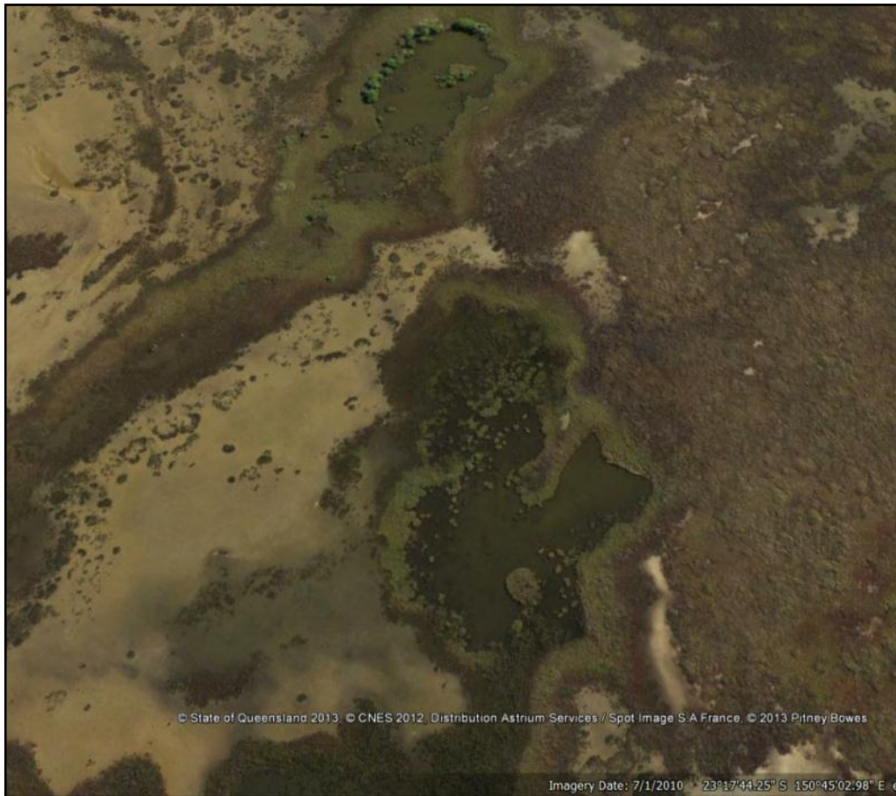
Figure 4.9: Example of marine swamps found in the lower portion of the Cawarral Creek declared FHA.

Shallow swamps are located in the lower reaches of the declared FHA, between Horton's Creek and the main channel. The extent and permanence of these habitats would depend upon tidal patterns and rainfall. Shallow swamps such as these have the capacity to support a range of fish species including juvenile barramundi (Baker & Sheppard 2006).