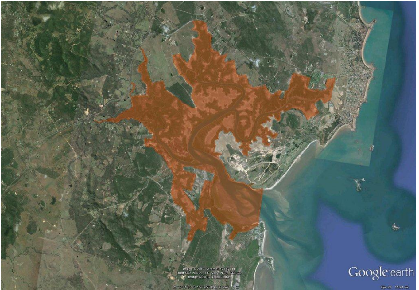
Figure 2.2: Tidal and intertidal areas in and adjoining the Cawarral Creek declared FHA.