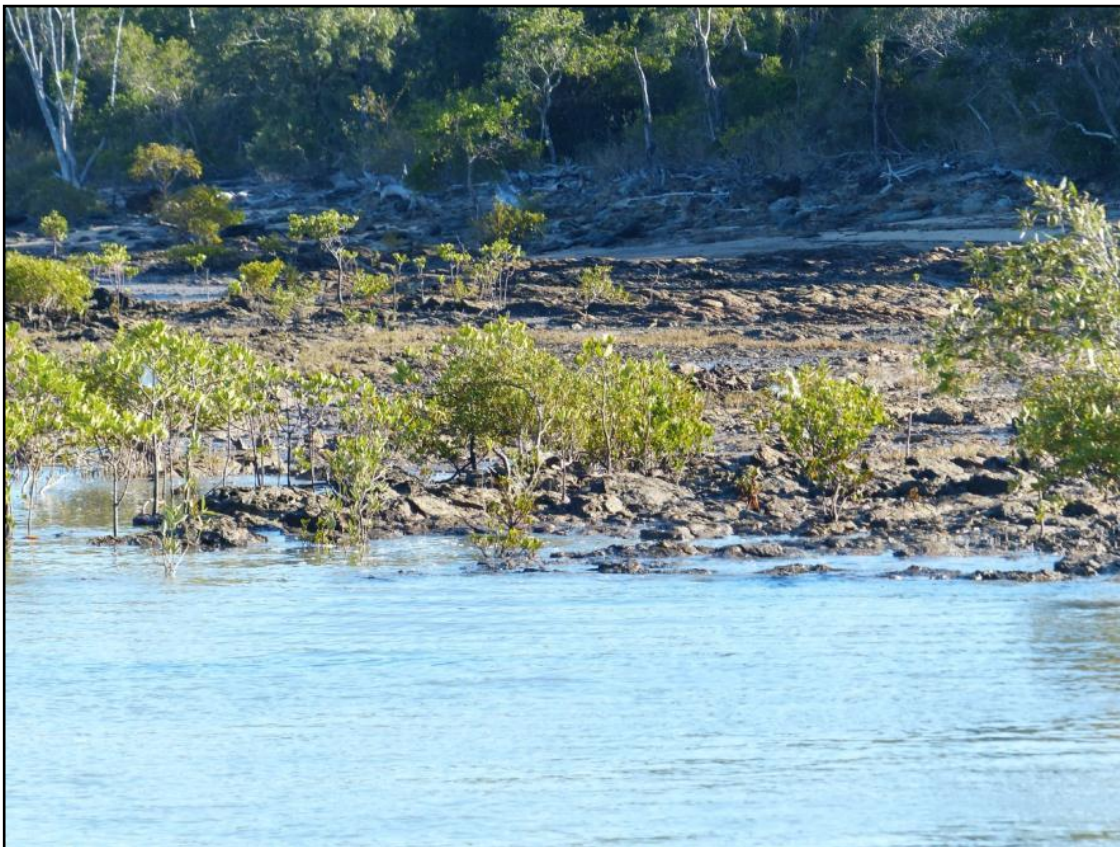
Figure 4.12: Intertidal rocky bank in the lower reaches of Cawarral Creek declared FHA.