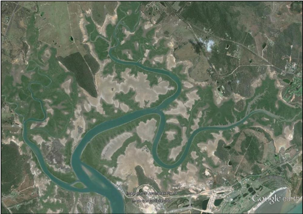
Figure 4.4: Main estuarine waterways of Cawarral Creek declared FHA.