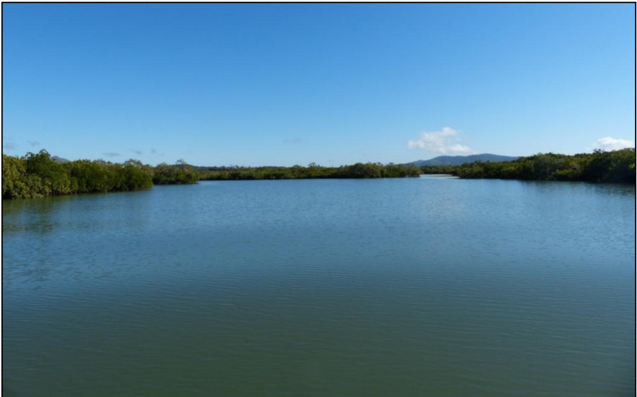
Figure 4.5: Estuarine waters of Cawarral Creek declared FHA.