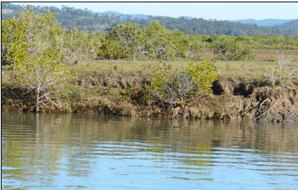
Figure 4.14: Overhanging bank typical of bank structure throughout Cawarral Creek declared FHA.