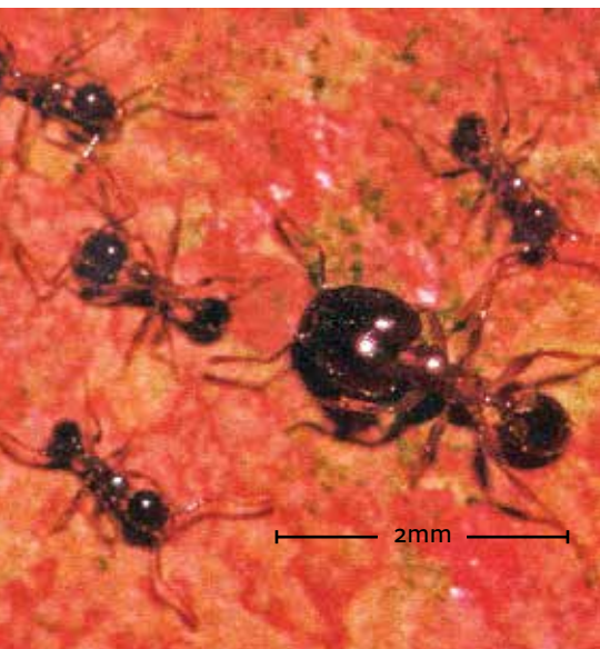
Introduced African big-headed ants were an instrumental aspect of Tryon Island's catastrophic loss of pisonia forest.