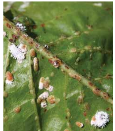
For a tiny animal, scale insects can cause a huge problem.

They might be difficult to see, but with the help of introduced ants, scale insects have deforested Tryon Island in the Capricornia Cays National Park. Introduced coastal brown ants (also known as African big-headed ants) farmed the scale for honeydew secretions and also defended them from naturally occurring predators. The scale outbreak took only seven years to devastate the island's pisonia forest, an important seabird breeding area. QPWS laid hundreds of ant baits in 2007 and 2008 near big-headed ant nests. This successful baiting program means the island's forests have almost fully recovered.