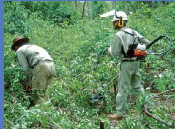
Weed management is an important part of the work of QPWS

Please play your part and be pest-free when you visit our beautiful Great Barrier Reef islands.