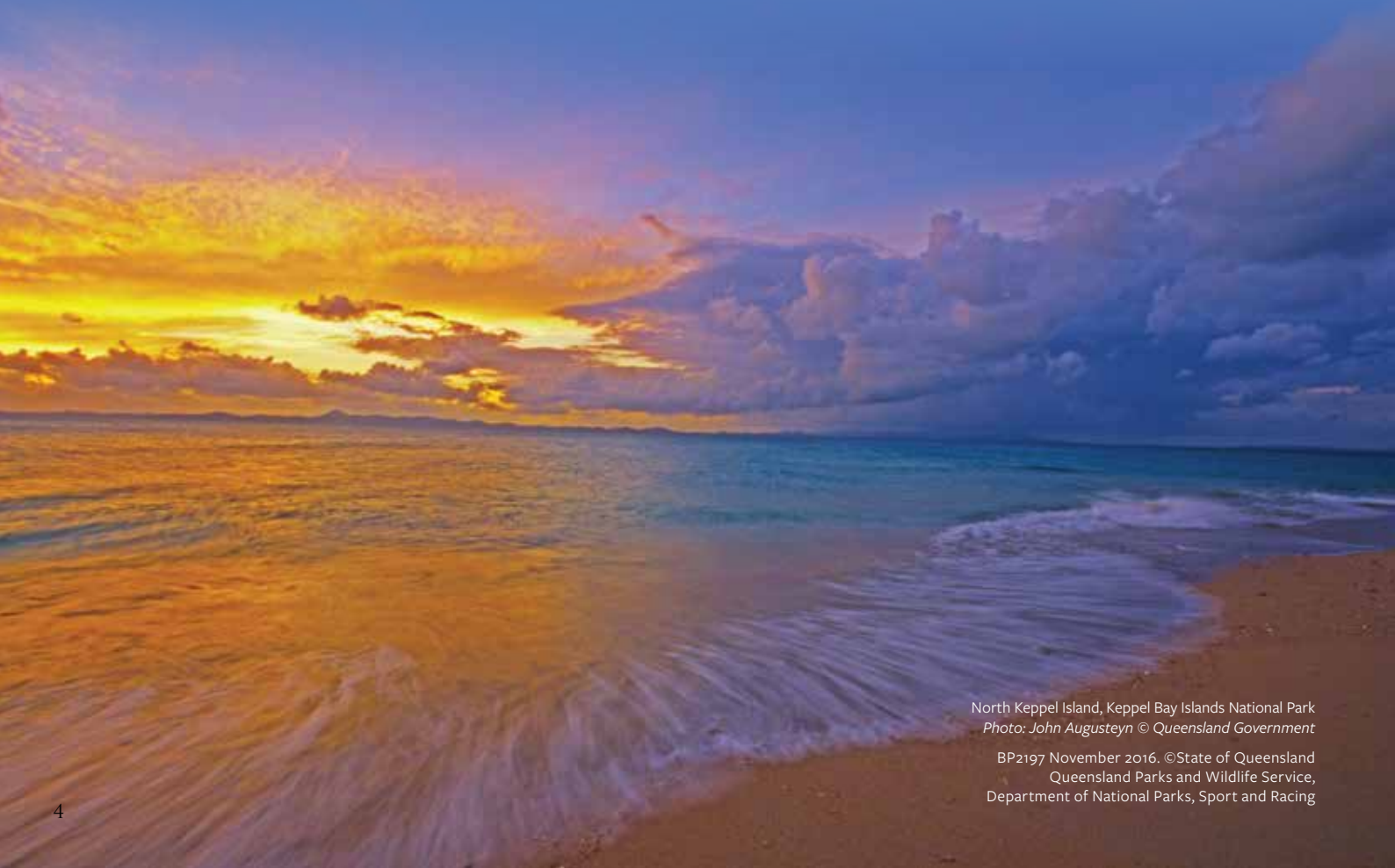
North Keppel Island, Keppel Bay Islands National Park