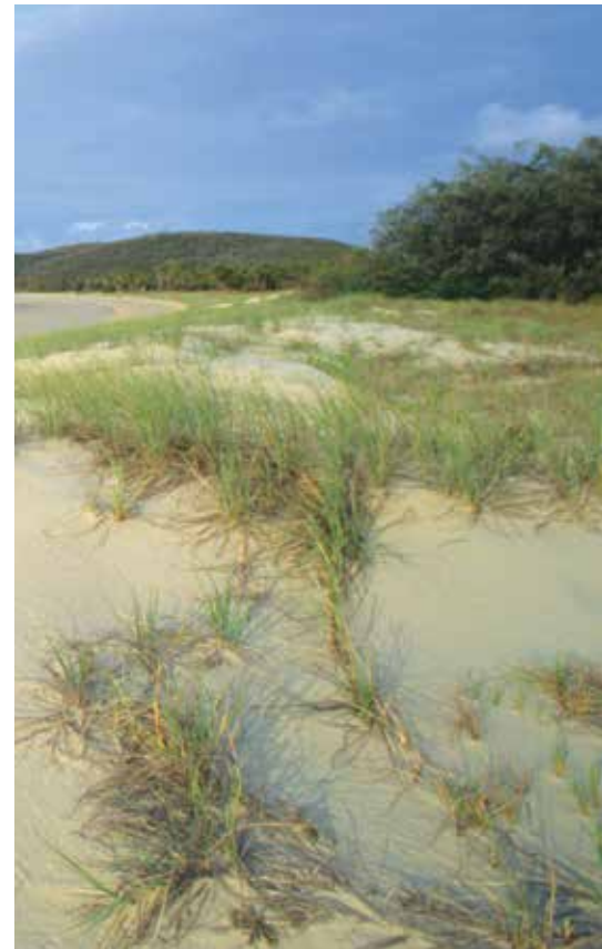
Queensland's outstanding national park islands are worth protecting now and for future generations