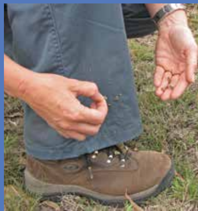
QPWS Rangers remove seeds from their uniforms to help prevent weeds from spreading throughout the protected areas they manage.