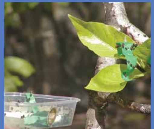
Releasing native predatory ladybirds helped control a scale insect outbreak on Wilson Island (Capricornia Cays National Park) before the effects were catastrophic.